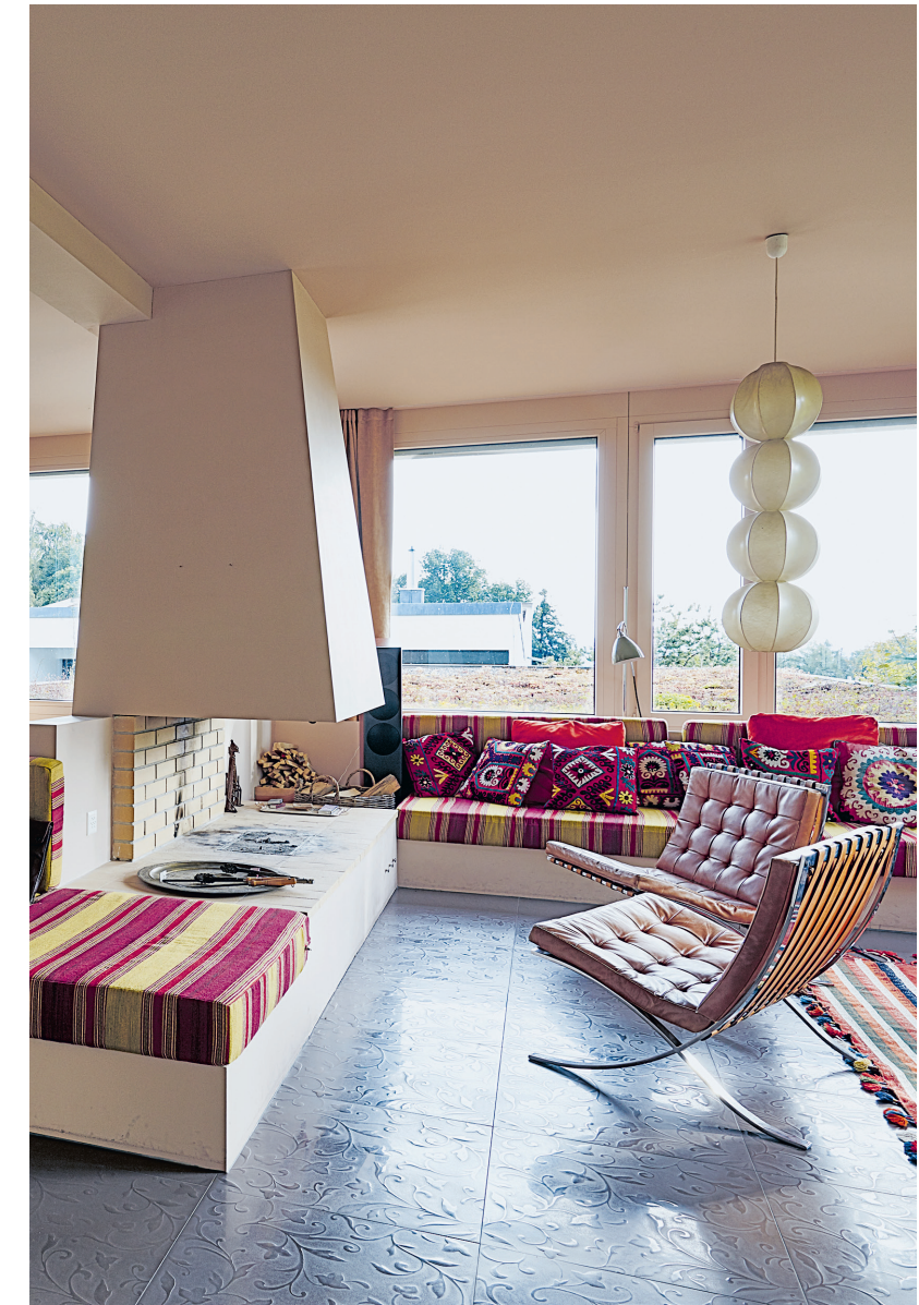
Bright and open rooms ensure a welcoming and idyllic family home in the countryside.